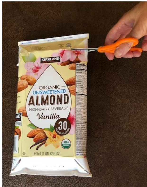
2. Flatten pack and cut off top and bottom along creases.