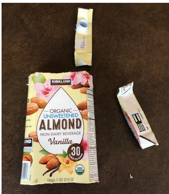
3. Throw away the top and bottom.