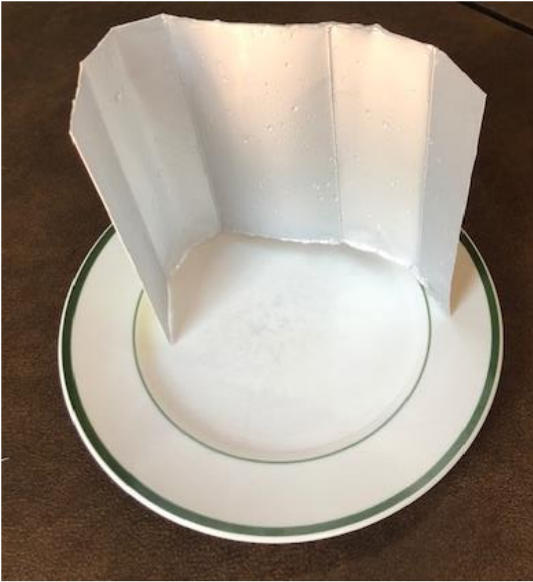
6. Wait till it dries.