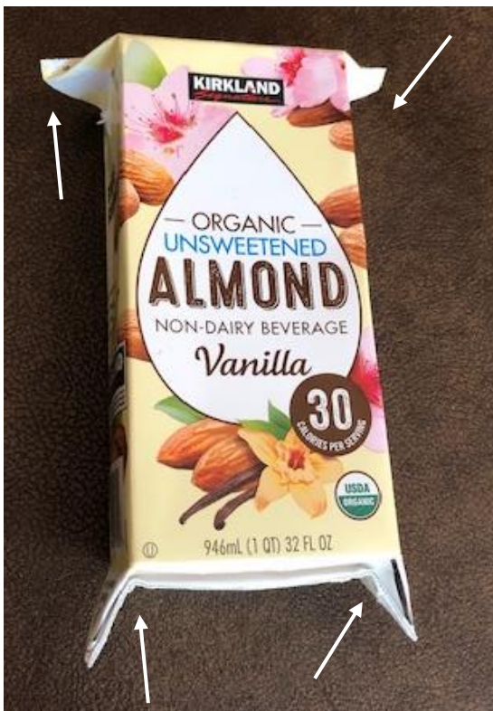
1. Flip the sides up

For Snapology Origami tutorials, please see David Honda's webpage: Snapology Icosahedron Presentation (Google Slides version)