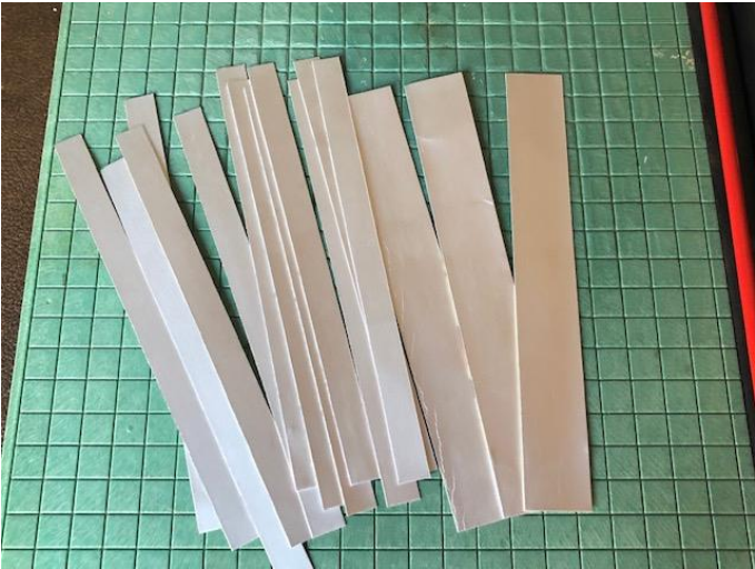
7. Start by cutting off the part where the pack was glued. 8. Cut into strips of desired thickness.